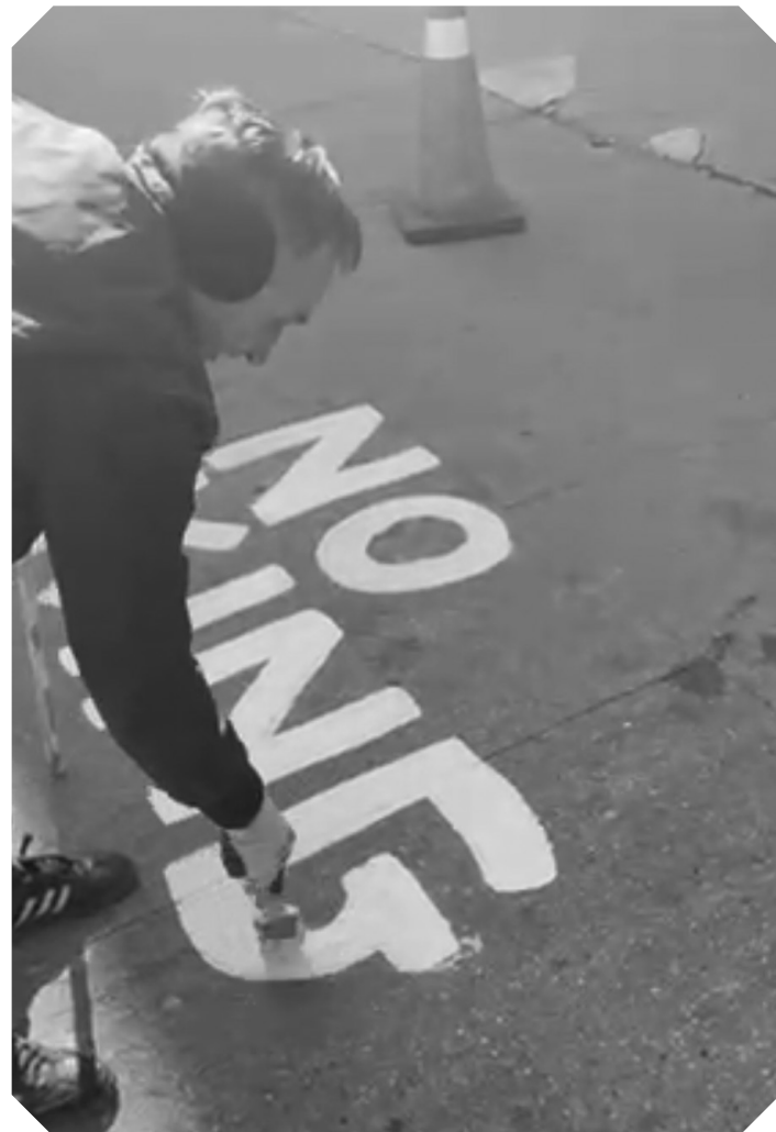
VIDEO / STILLS